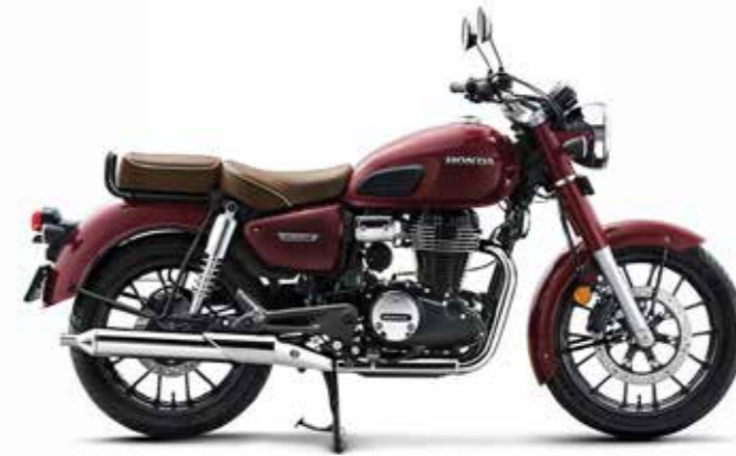
Precious Red Metallic