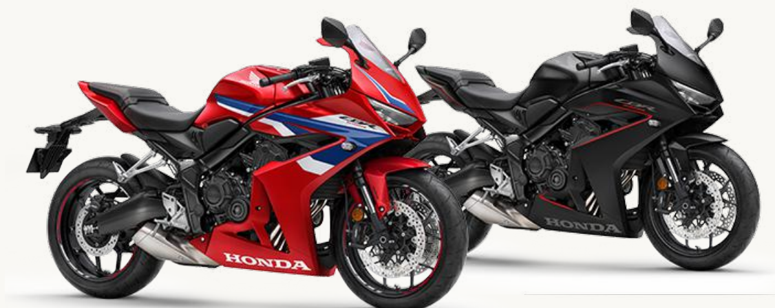
GRAND PRIX RED